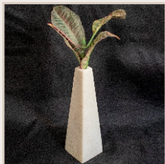
TRUNCATED PYRAMID VASE White Indian Marble 2.25*2.25*7.5 inches