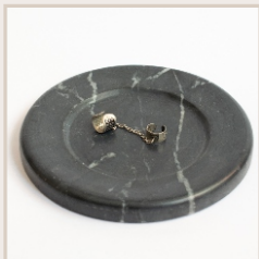
MOON TRINKET TRAYS Black Marble 5*5*0.5 inches