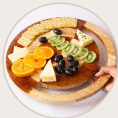
TWO-HUED Cheese Platter Mango Wood 13*13*0.5 inches