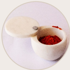
GIBBOUS PINCH BOWL White Indian Marble 3.25*3*2.75 inches