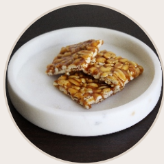
TAPER PLATTER White Indian Marble 6.25*6.25*1 inches